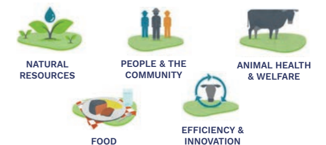
FIGURE 2. GRSB CORE PRINCIPLES 74

GRSB: There are 5 core principles identified, as displayed below. The GRSB also consists of allied national roundtables or initiatives, which now exist in over 20 countries 72 . However, a certification framework has so far only been developed in Canada 73 .