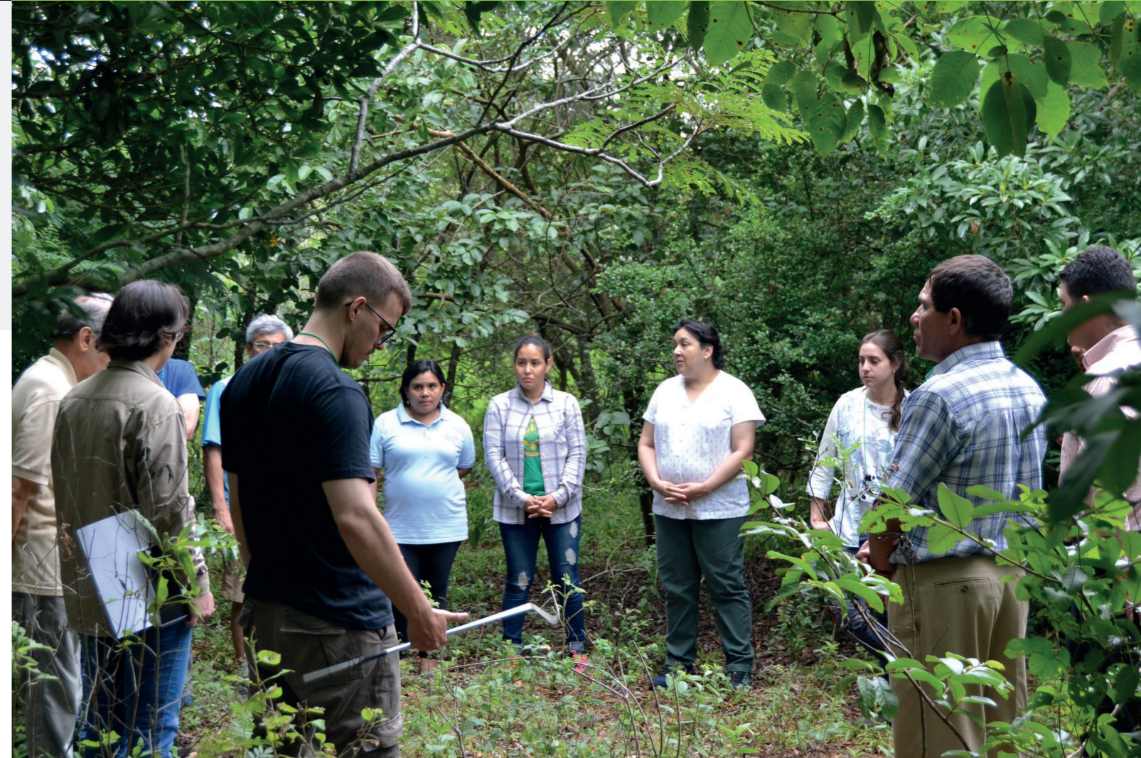
Participants in an ecosystem restoration course at the ecofarm. ↑

This initiative has received financial support from a diverse range of civil society organisations (CSO) and foundations. However, restrictive government policies relating to CSO finance have recently caused difficulties.